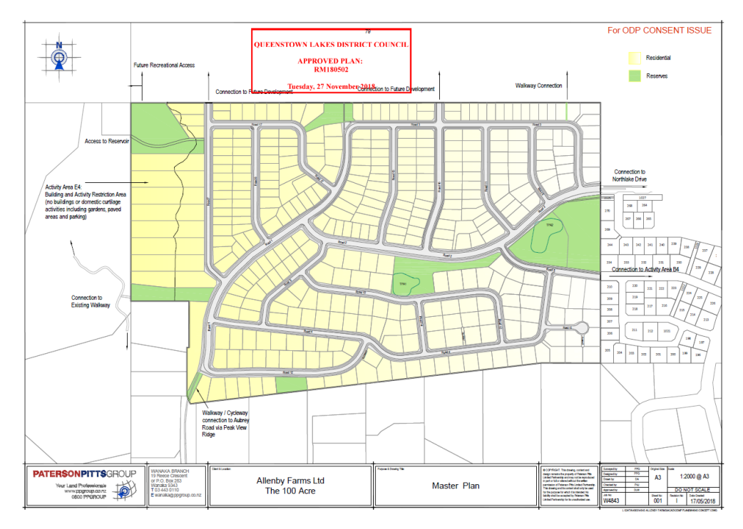
Figure 3 Outline Development Plan Resource Consent RM180502