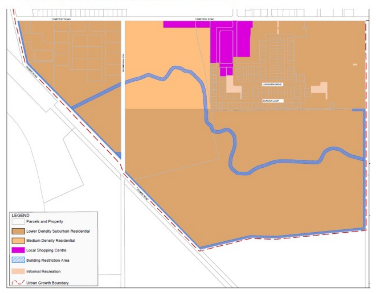
Figure 1: PDP zoning of Lake Hāwea South.

As a consequence of an Environment Court Consent Order, Lake Hawea South is now zoned Lower Density Suburban Residential Zone, Medium Density Residential Zone, Local Shopping Centre Zone, and Informal Recreation as shown in Figure 1 below.