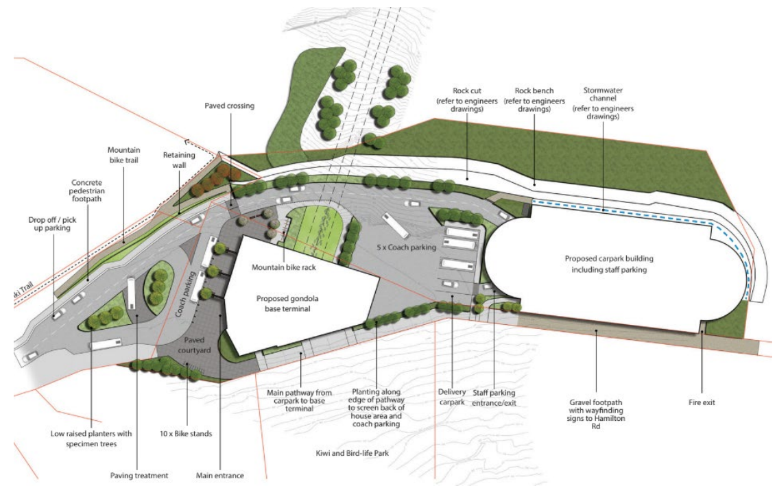
Figure 1: Suggested Redevelopment (note: planting along edge of pathway is excluded)