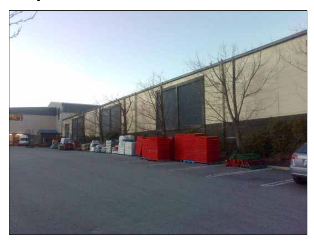
Figure 1: Poorly located car parking with no footpaths behind The Warehouse, being used for outdoor storage.

The existing car parking in Activity Area 5 also does not work particularly well in terms of pedestrian movements within the shopping centre. For example a pedestrian attempting to go from New World to Canterbury of New Zealand has to navigate the main road serving the entire shopping centre, with the nearest pedestrian crossing being near Hamills. This forces pedestrians to do a large loop, instead of being able to walk directly from A to B. Similarly, the entrance to Mitre 10 blocks the footpath, forcing pedestrians not wanting to go to Mitre 10 to negotiate two sets of swinging doors (often with buggies or trolleys). When Mitre 10 is closed, the doors are locked and pedestrians are forced onto the vehicle carriageway.