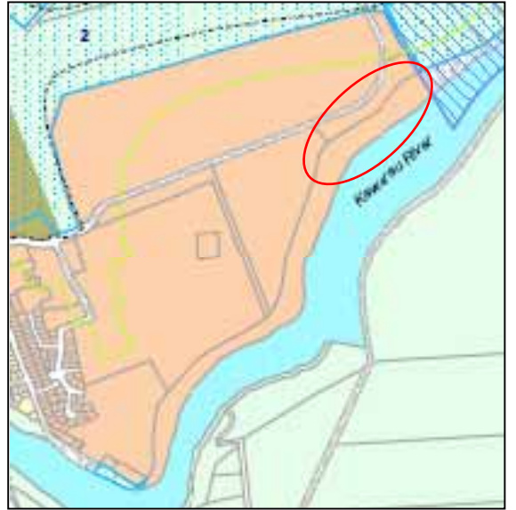
Figure 3: Zoning following 16 May 2011 Clause 20A

The request by the applicant seeks that the zoning be shown as it currently appears in the operative planning maps, that is, as it is shown in Figure 3 above. However as noted, the current operative planning map contains an error, and the actual zoning should be as shown in Figure 1 above.